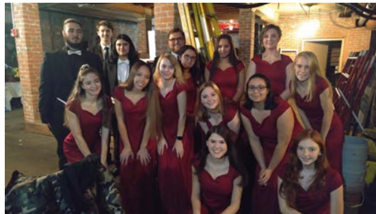
The Show Choir