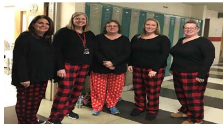
Math Department Spirit